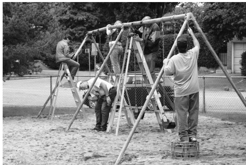
“Are we done yet?” Heron Park volunteers spruce up the swing sets to colour coordinate with new play structures.

Tel/Tél: 990-8640 Fax/Télex: 990-2592 Email/Courriel: McGuinty.D@parl.gc.ca