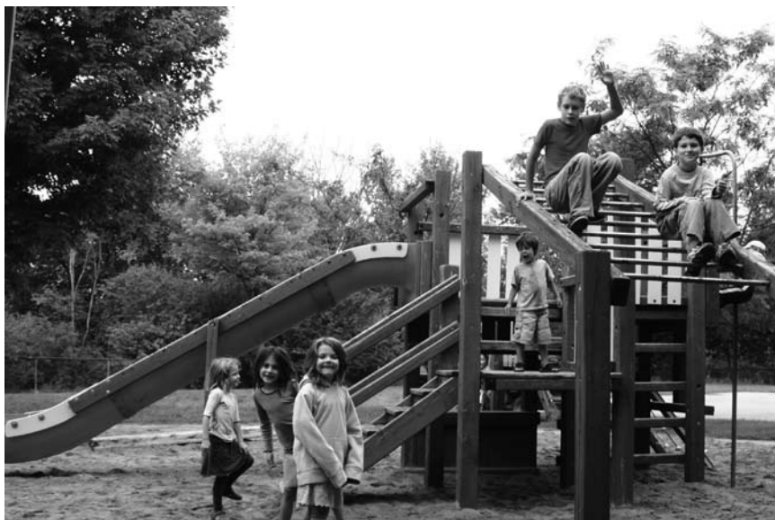
Neighbourhood kids enjoy one last playtime on the old Heron Park play structure prior to its removal in late August.